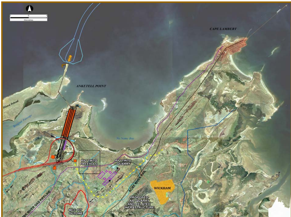
Design for Stage 1 of the West Pilbara Iron Ore Project

Detailed environmental and technical studies have been conducted on the proposed port facility at Anketell Point, with a draft Public Environmental Review to be submitted to the Environmental Protection Agency this month and a Definitive Feasibility Study for Stage 1 of the West Pilbara Iron Ore Project, including the development of a mine, 275km of new railway and port facilities at Anketell Point, due to be completed next month. The plan below shows the development required at Anketell Point for the Project. Approximately AUD145 million has been invested to date on the mine, rail and port facilities studies.